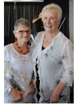
A note from RED SOX